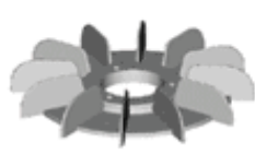
Flatback Style ( - 2 ) Series