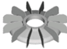
Dish Style ( - 0 ) Series